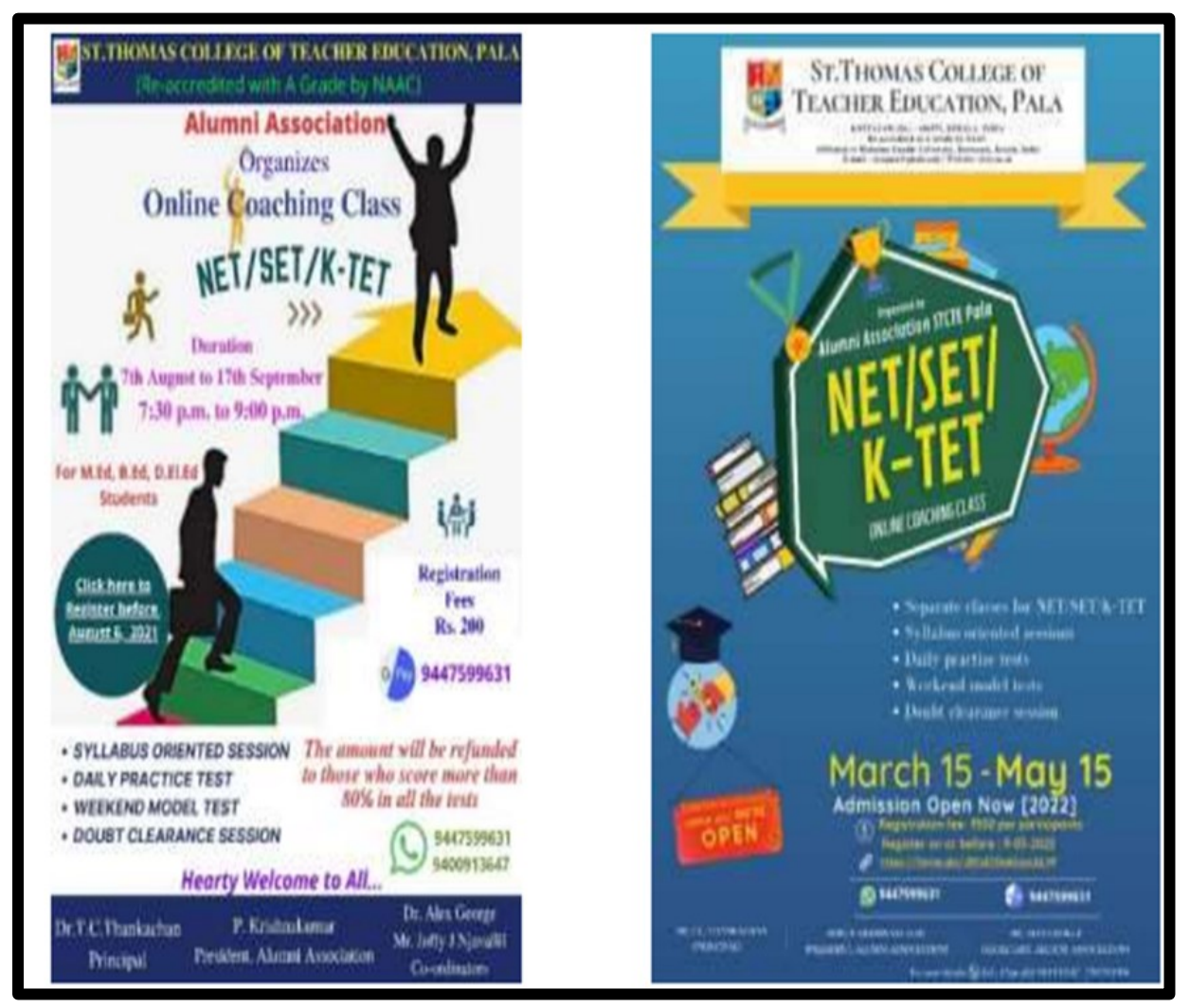
Alumni support given for preparing Online alumni NET/SET/ TET coaching held between 15.3.22 to 15.5.22