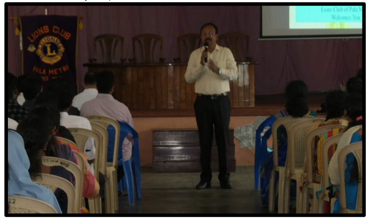
Yooth Empowerment programme held on 9.3.21