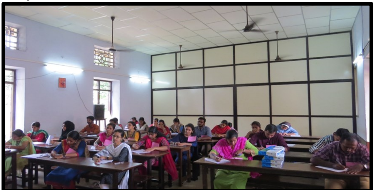
3. Organisation of various activities other than class room activities