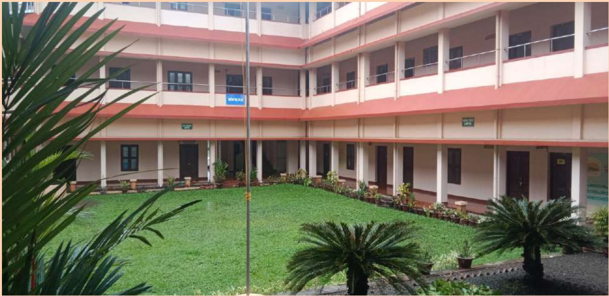
St. Thomas College of Teacher Education, Pala, Kerala Affiliated to Mahatma Gandhi University, Kottayam