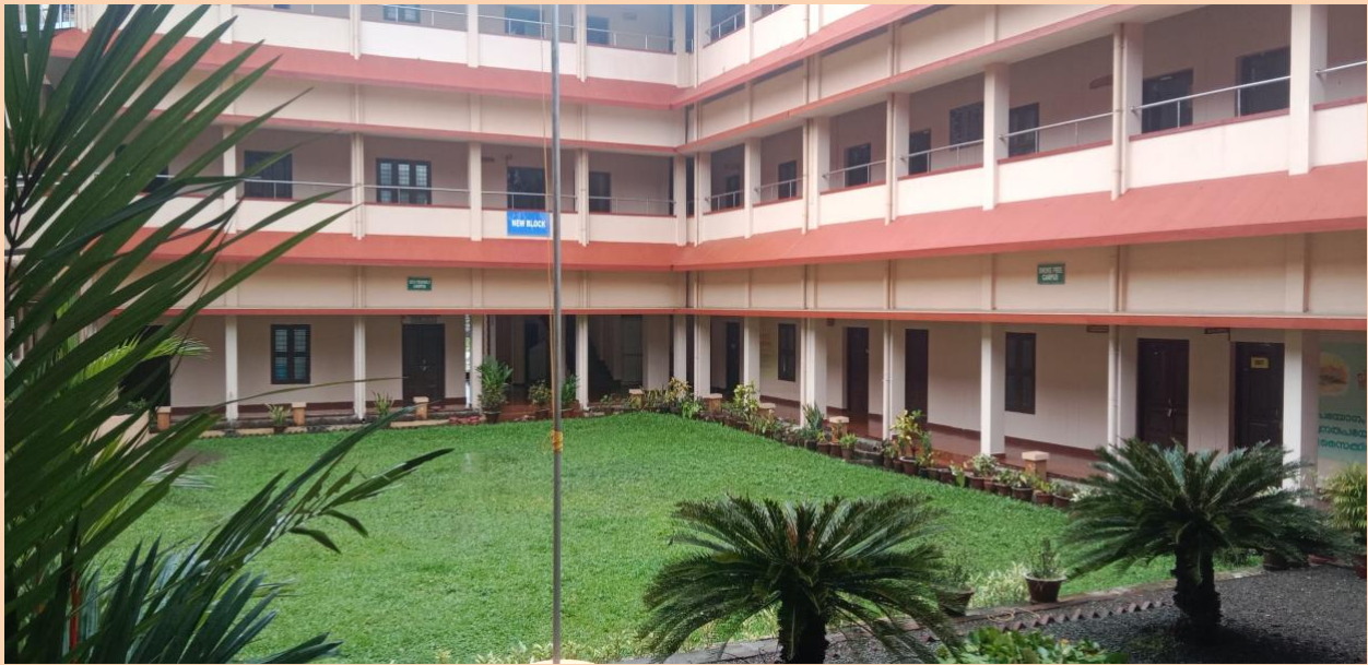
St. Thomas College of Teacher Education, Pala, Kerala Affiliated to Mahatma Gandhi University, Kottayam