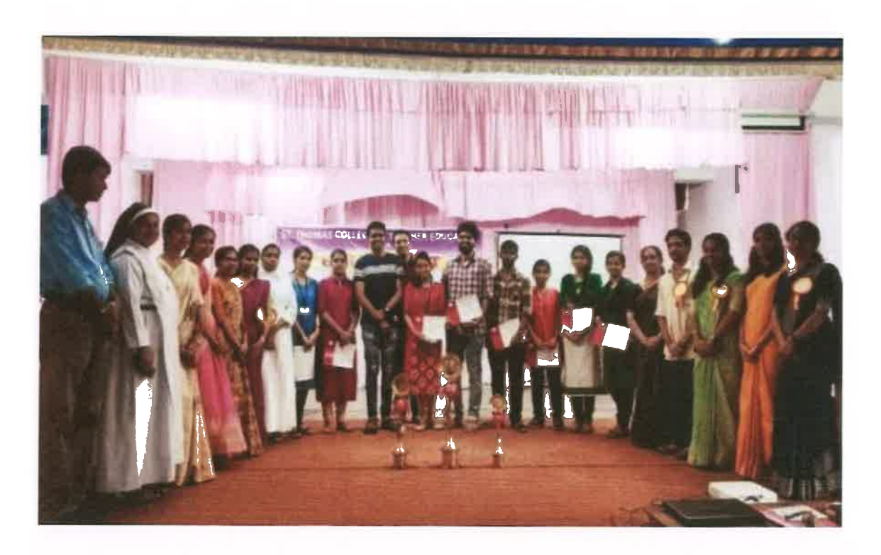
All Kerala Inter College Quiz Competition on English Language and Literature organised by 'Purple Patch' was conducted on 15/01/2019