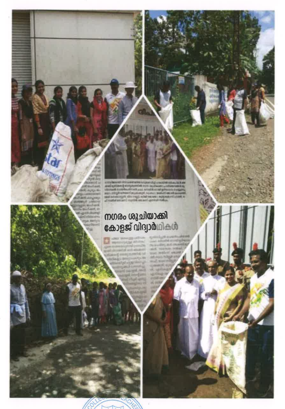
Student Teachers on cleaning the roads, drainage and town on 02/10/2018

PRINCIPAL ST. THOMAS COLLEGE OF TEACHER EDUCATION PALA