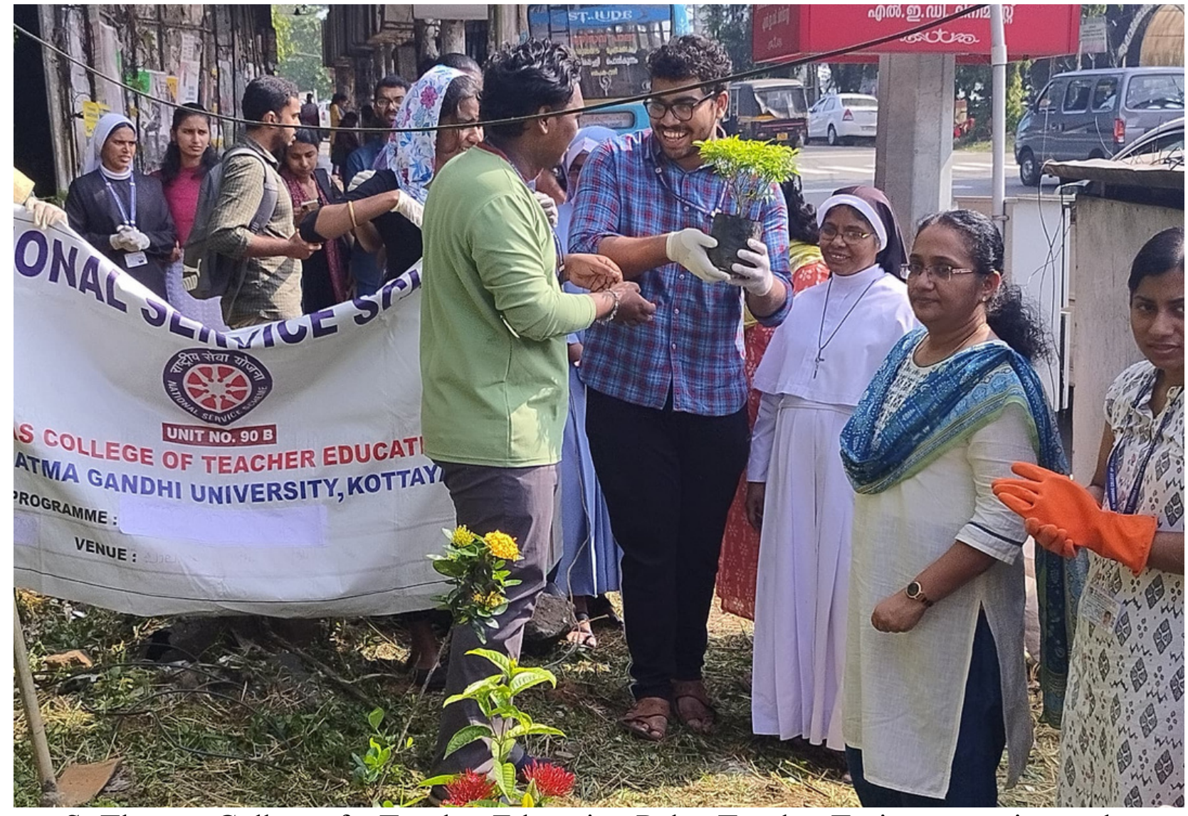
St. Thomas College of a Teacher Education Pala: Teacher Trainess creating and maintaining, garden near pala private bus stop from 23 December 2023 onwards

A group of teacher trainees have embarked on the Sneharaamam project, a community-focused initiative aimed at beautifying the area surrounding the Pala private bus stop. Since December 23, 2023, these dedicated individuals have been actively involved in the creation and ongoing maintenance of a vibrant garden at this location. Their efforts have not only enhanced the aesthetic appeal of the bus stop but also contributed to a greener and more welcoming environment for both commuters and residents of the surrounding area."