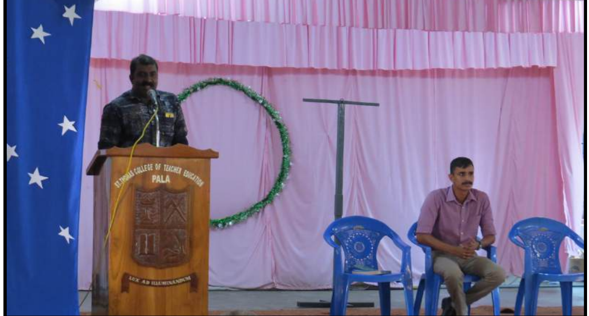
Drama Session against Drug Abuse,2018-19