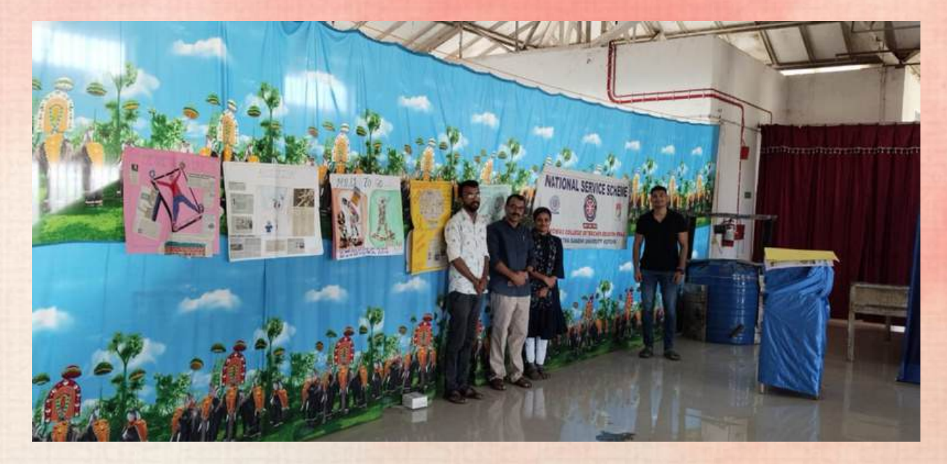
Anti-Drug Campaign - Exhibition , 28/12/24