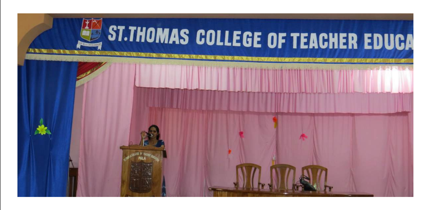
Women Security programme, 2018

'Orange: The World Campaign' in collaboration with ICDS Lalam, WCD Anthinad which mainly focused to eliminate all kinds of violence against women.