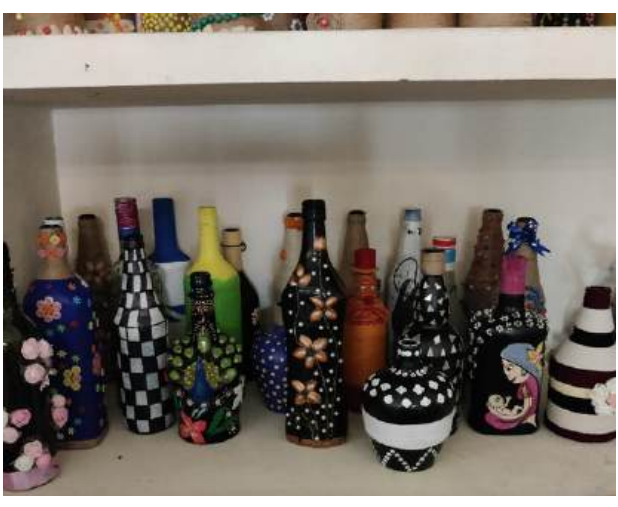
Bottle Art Training for 2021-23 Batch