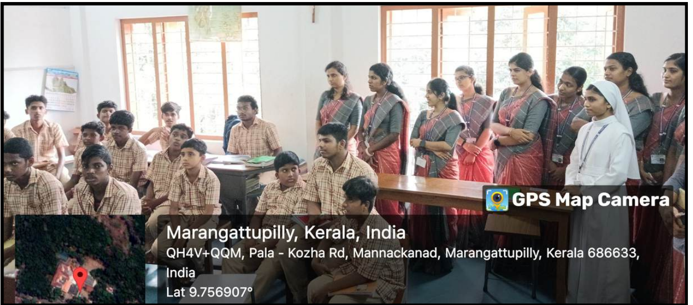
OLC School for The Deaf, Mannacknad Visiting on 11 October 2023