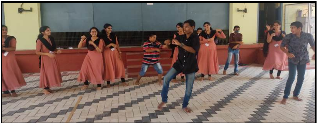
2021-23 Batch Students Visiting Santhinilayam Special School, Anthinad on 11 March 2022