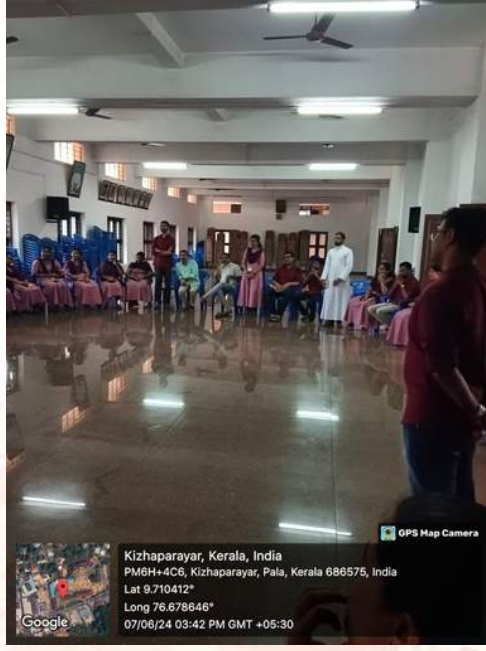
Kizhapparayar, Kerala, India PM6H+4C6, Kizhapparayar, Pala, Kerala 686575, India Lat 9.710412° Long 76.678646° 07/06/24 03:42 PM GMT +05:30