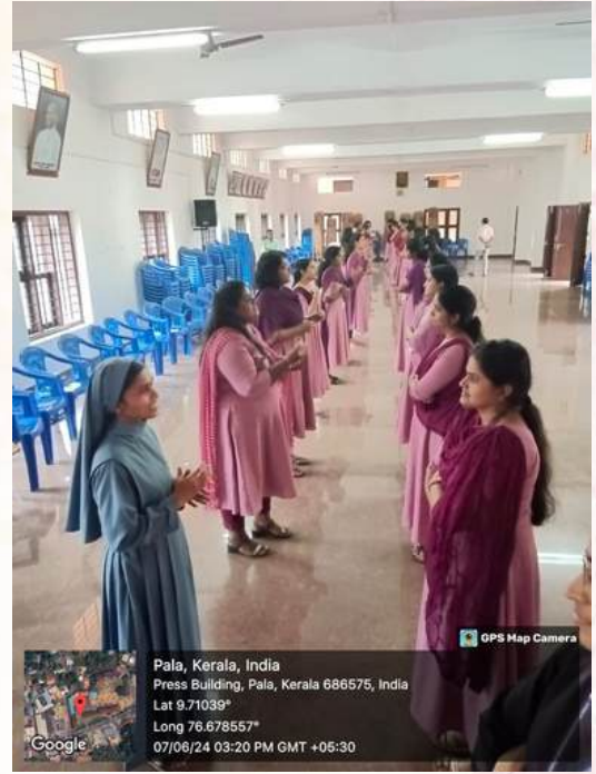
Pala, Kerala, India Press Building, Pala, Kerala 686575, India Lat 9.71039° Long 76.678557° 07/06/24 03:20 PM GMT +05:30