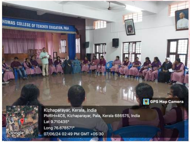
Kizhapparayar, Kerala, India PM6H+4C6, Kizhapparayar, Pala, Kerala 686575, India Lat 9.710435° Long 76.678571° 07/06/24 02:49 PM GMT +05:30