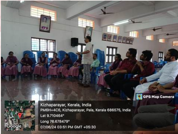
Kizhapparayar, Kerala, India PM6H+4C6, Kizhapparayar, Pala, Kerala 686575, India Lat 9.710464° Long 76.678479° 07/06/24 03:51 PM GMT +05:30