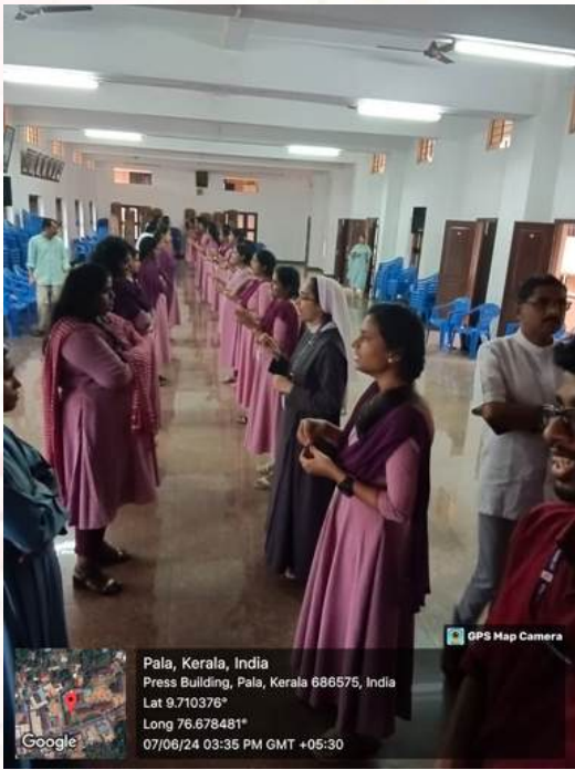
Pala, Kerala, India Press Building, Pala, Kerala 686575, India Lat 9.710376° Long 76.678481° 07/06/24 03:35 PM GMT +05:30