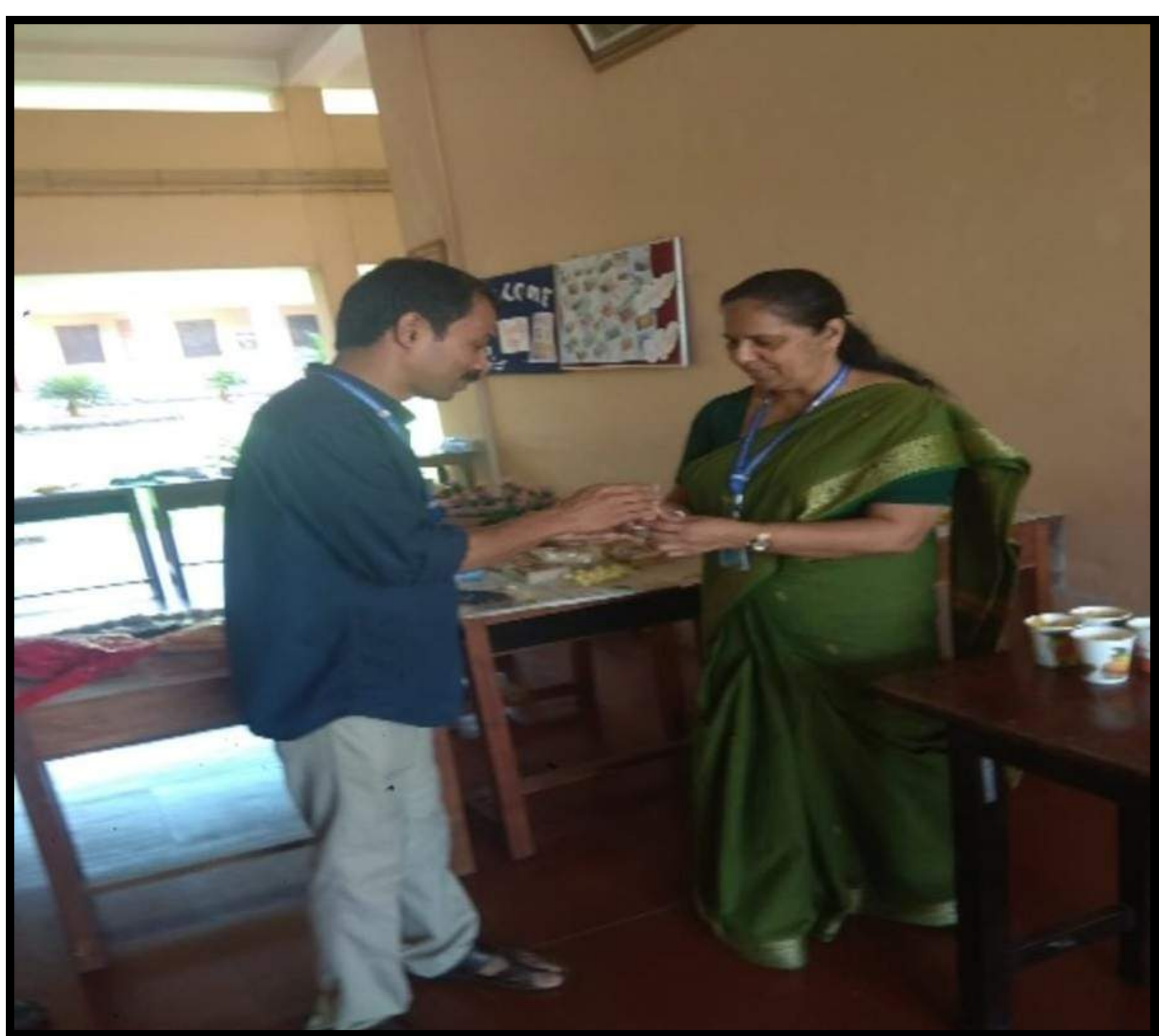
Conducting Pineapple Stall to Enhance Business Skill on 22-23 december 2022