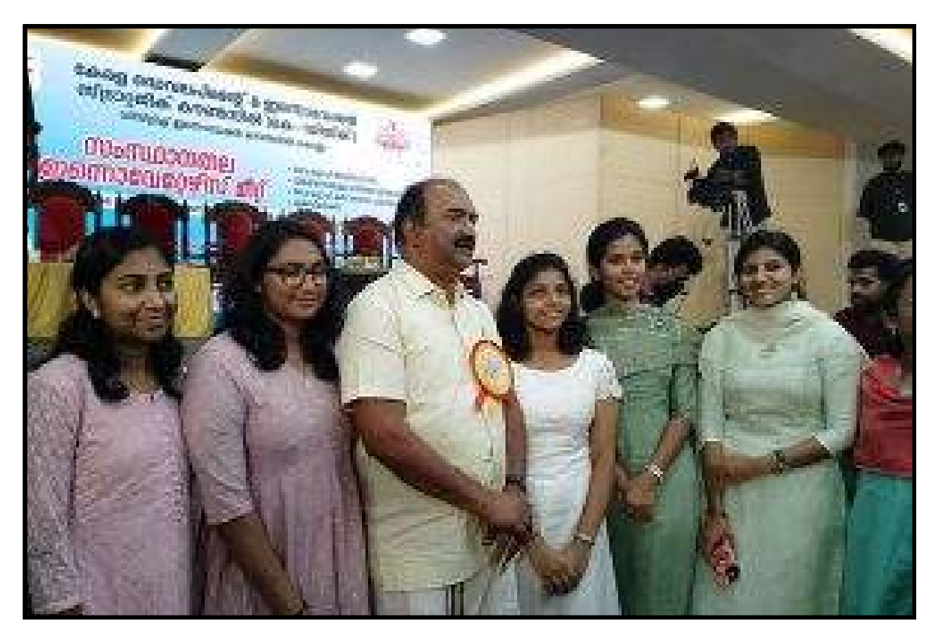
Interaction with Mr K.N. Balagopal, Finance Minister, Kerala.