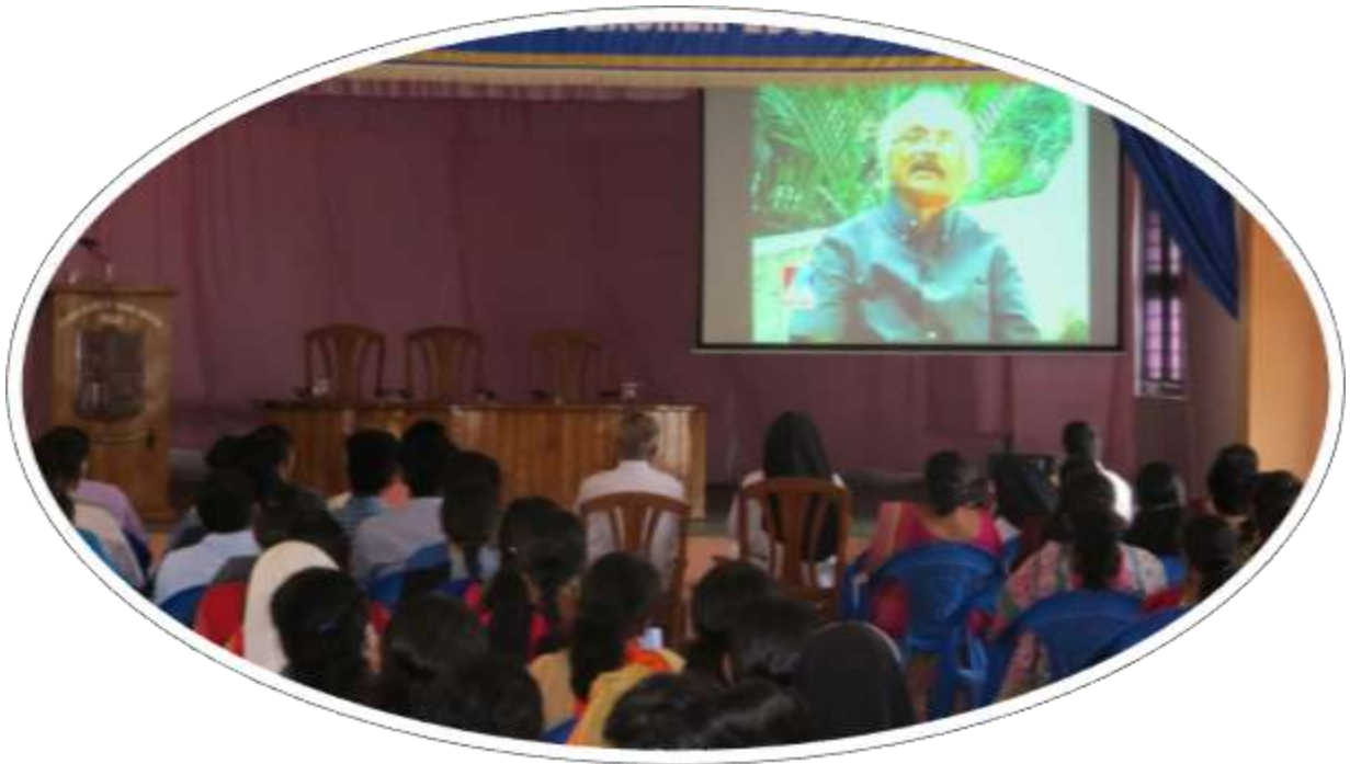
Video screening on history of Malayalam Literature